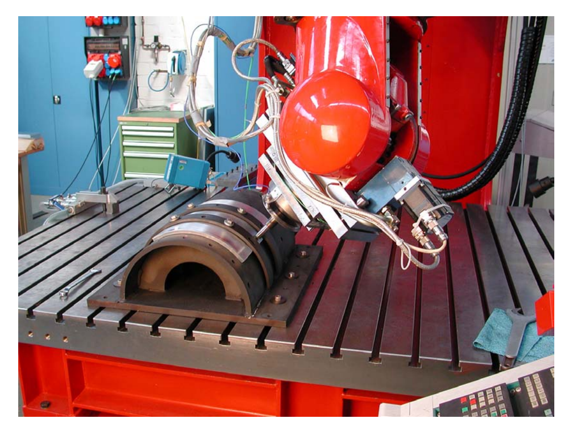
Figure 4 - Friction Surfacing with an SMT Tricept TR 805 Robot (GKSS Forschungszentrum)