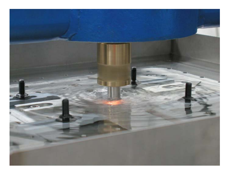
Figure 4 – Underwater friction surfacing using the Circle Technical Services HMS 3000 in a Portal frame.

The industrial objectives of the project were the development of micro friction surfacing procedures, the optimisation of the process, the development of procedures for depositing corrosion resistant surfaces, the development of equipment and procedures for underwater friction surfacing (Figure 3) and the development of robotic friction surfacing procedures (Figure 4). Results achieved are encouraging and the project partners feel that they have reached the overall objectives. The work done on the project is of direct commercial importance to the SME partners and suitable for commercial exploitation.